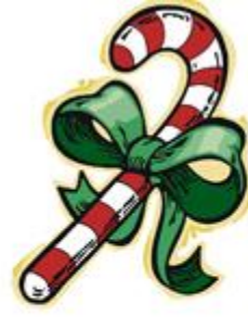
a candy cane