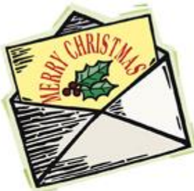
a Christmas card