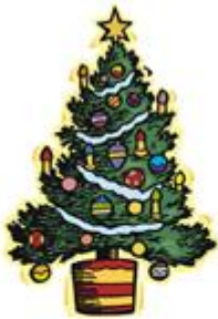
a Christmas tree