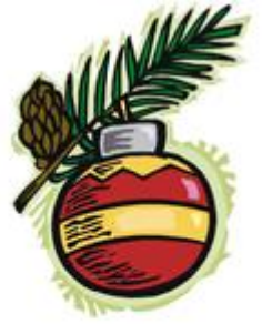
a Christmas decoration