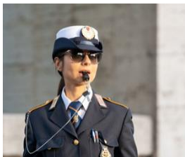
5. police officer