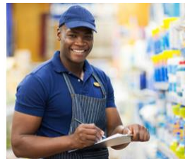
3. shop assistant