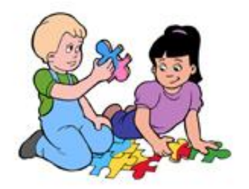
do a puzzle