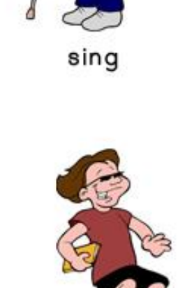
ride a skateboard