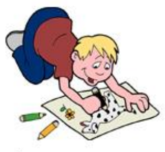
draw a picture