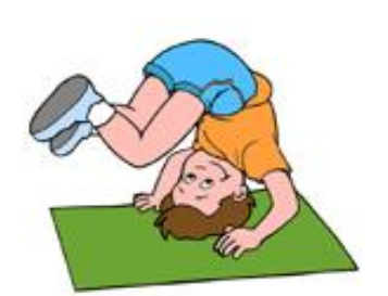
do a somersault