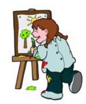
paint a picture