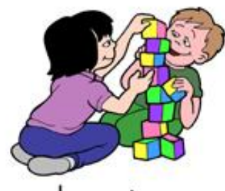
make a tower